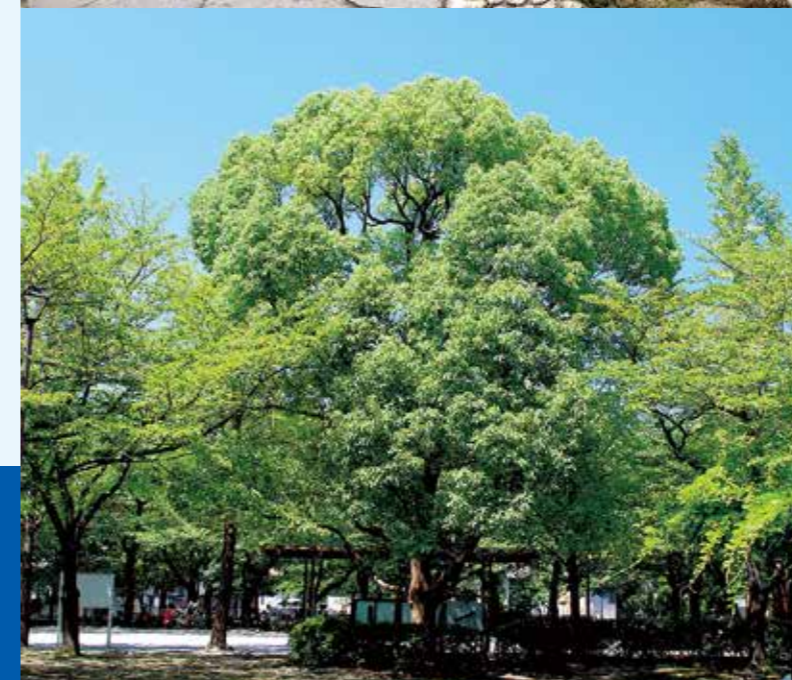
Tree of the City: Camphorwood