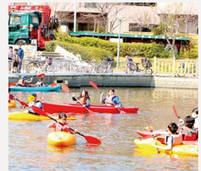
Canoeing (in Shinsakongawa Shinsui Park canoe Area)