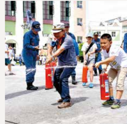
Emergency drill in the Komatsugawa and Hirai areas