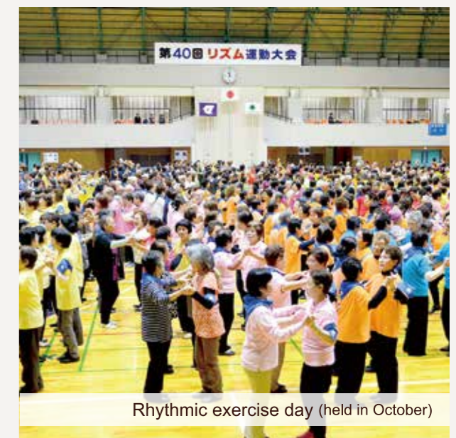
Rhythmic exercise day (held in October)