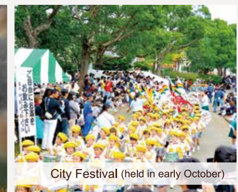
City Festival (held in early October)