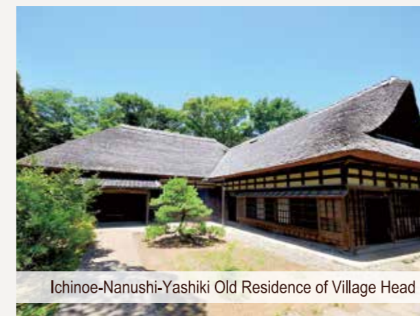
Ichinoe-Nanushi-Yashiki Old Residence of Village Head