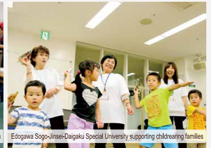
Edogawa Sogo-Jinsei-Daigaku Special University supporting childrearing families