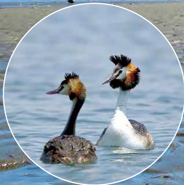
Great crested grebe

More than 20,000 birds come here in winter. (Waterfowl that satisfy the criteria for registration on the Ramsar Convention wetland)