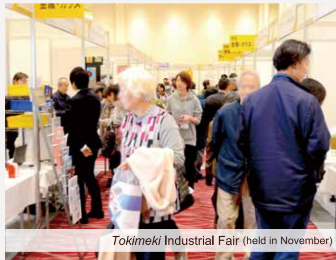
Tokimeki Industrial Fair (held in November)