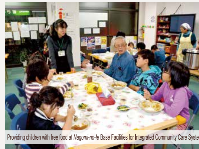
Providing children with free food at Nagomi-no-Ie Base Facilities for Integrated Community Care System