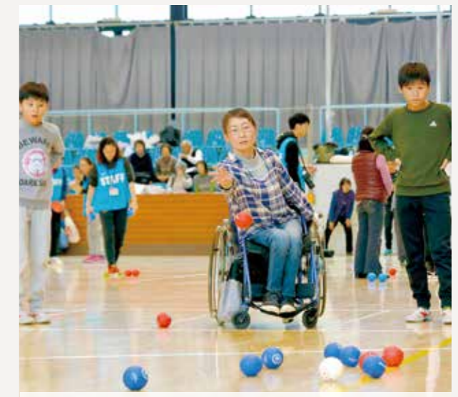
Boccia (in Sogo Gymnasium etc.)