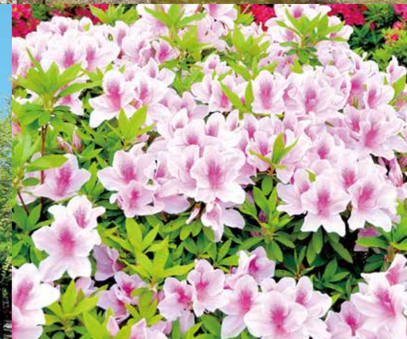
Flower of the City: Azalea