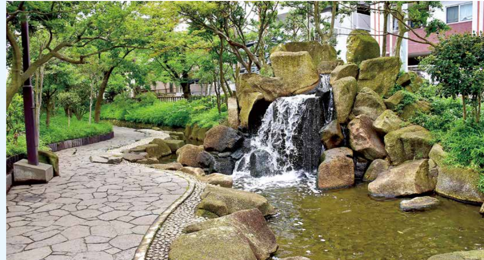
Furukawa Shinsui Park (the first Shinsui park in Japan)

In May 2021, Edogawa City was selected as an SDGs Future City for its excellent efforts to achieve the SDGs.