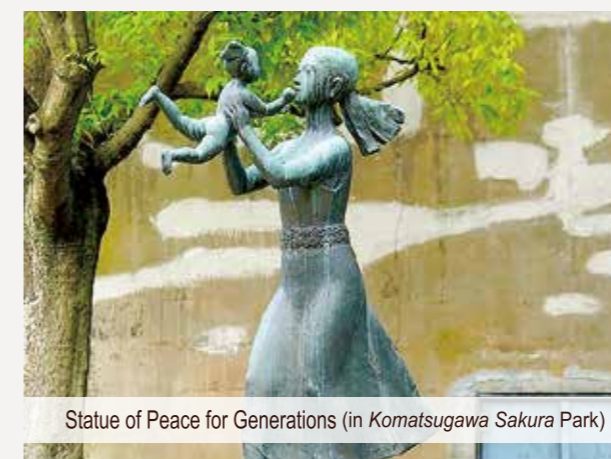
Statue of Peace for Generations (in Komatsugawa Sakura Park)