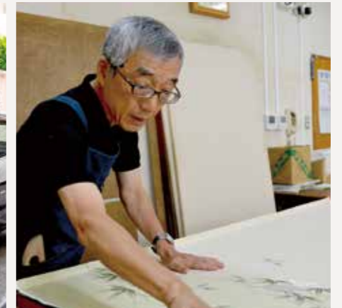
Japan's first staffing service for senior citizens established (the current Human Resources Center for the Elderly).