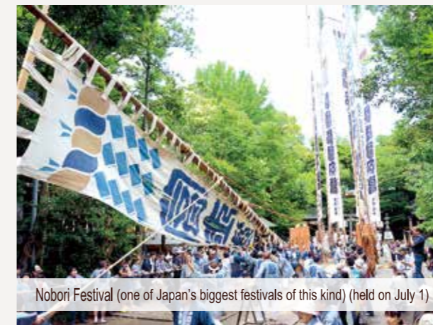
Nobori Festival (one of Japan's biggest festivals of this kind) (held on July 1)