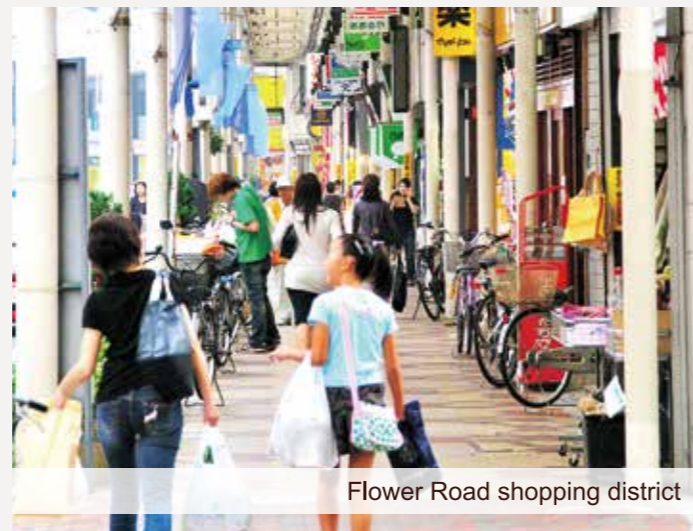
Flower Road shopping district