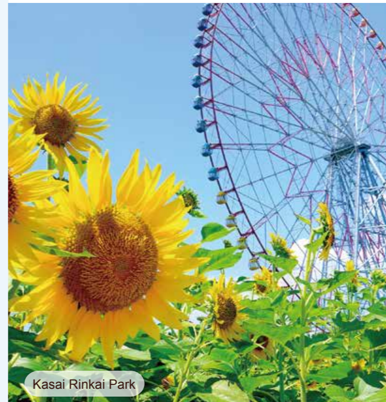
Kasai Rinkai Park

Edogawa City Planning Section, Management and Planning Department and Public Relations Section, SDGs Promotion Department 1-4-1, Chuo, Edogawa-ku 132-8501 ☎03-3652-1151