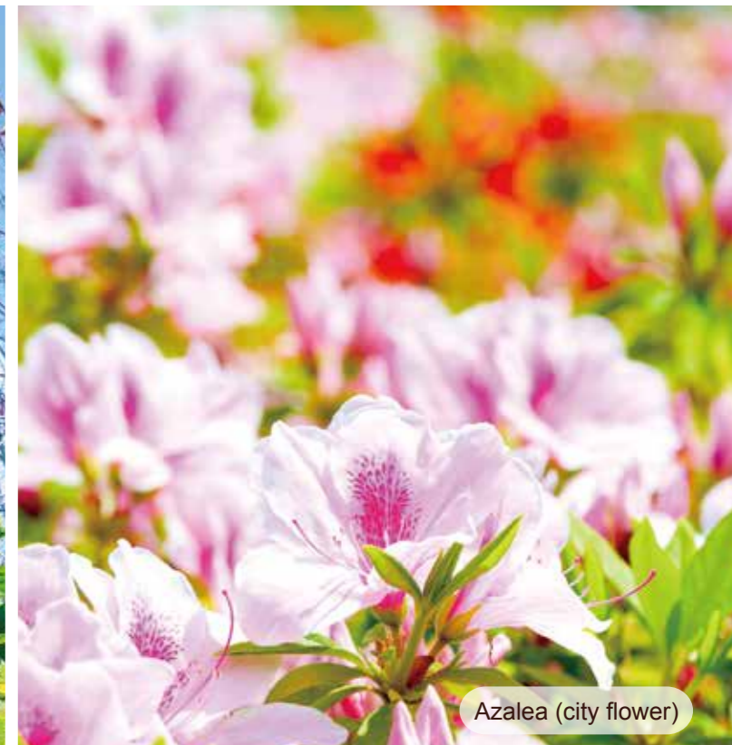
Azalea (city flower)