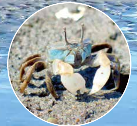
Small ghost crab

The park is a winter habitat and shelter for greater scaups, great crested grebes, and many other migratory birds. Black-faced spoonbills and other global rare wild birds also fly to the park.