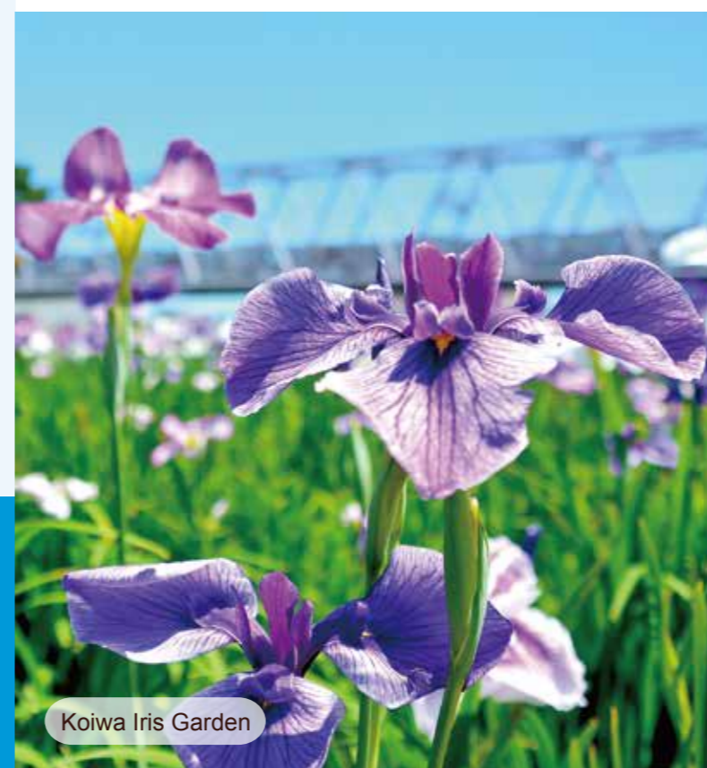
Koiwa Iris Garden